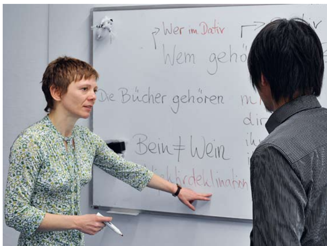
In class by Mitsuteru Sawa

— On this page you will find all the benefits which you may expect from a Eurocentres school and which apply to your course. On the relevant pages in the brochure you will find specific details of each school, on the exams, general conditions etc. If you are looking for first-hand information visit eurocentres-friends.com on facebook.