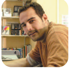
Small class sizes of 6 or 12 help you make fast progress.