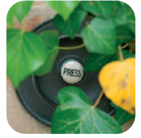
Many courses have weekly start dates so you can start your course any Monday.