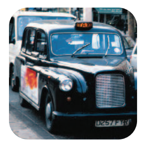
To make your journey easy, we can arrange for an individual transfer to your accommodation from all the major airports.