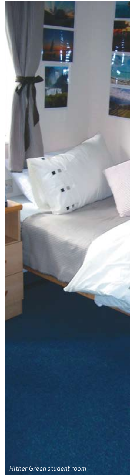
Hither Green student room